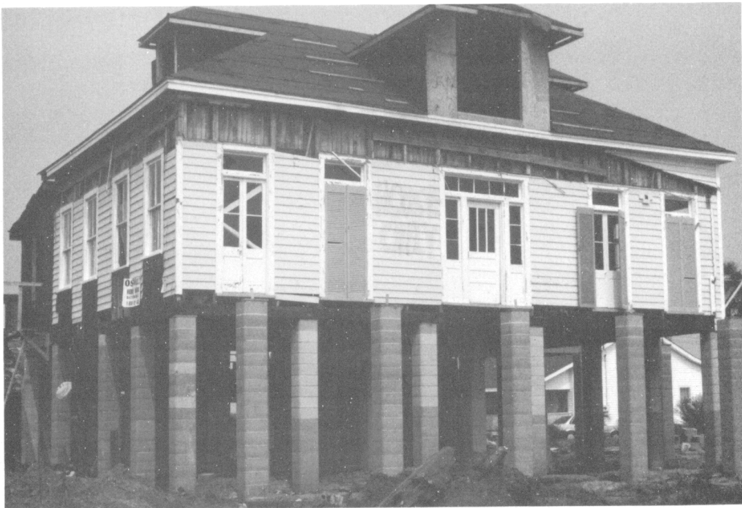
Figure 3. Photograph of a Pre-FIRM structure located on Sullivan's Island, South Carolina which was substantially damaged during Hurricane Hugo. NOTE: The structure is in the process of being repaired and has been elevated to or above the base flood elevation in accordance with NFIP requirements (Refer to Question No. 14).

A. If a substantially damaged structure is located in a coastal high hazard area (V-Zone) it not only must be elevated to or above the base flood elevation, but it also must comply with additional requirements contained in 60.3(e) of the NFIP regulations. These requirements call for the elevation to be on pilings or columns so that the bottom of the lowest horizontal structural member of the lowest floor is elevated to or above the base flood level. This pile or column foundation supporting the structure must also be anchored to resist flotation, collapse and lateral movement due to the combined effects of wind and water loading forces which equal the 100-year mean recurrence interval. Before the permit to repair or rebuild a substantially damaged structure in a V-Zone is granted, a registered professional engineer or architect must develop, review and certify that the structural design, specifications and plans for the construction are in accordance with accepted standards of practice for meeting the above requirements for V- Zone foundations and anchoring.