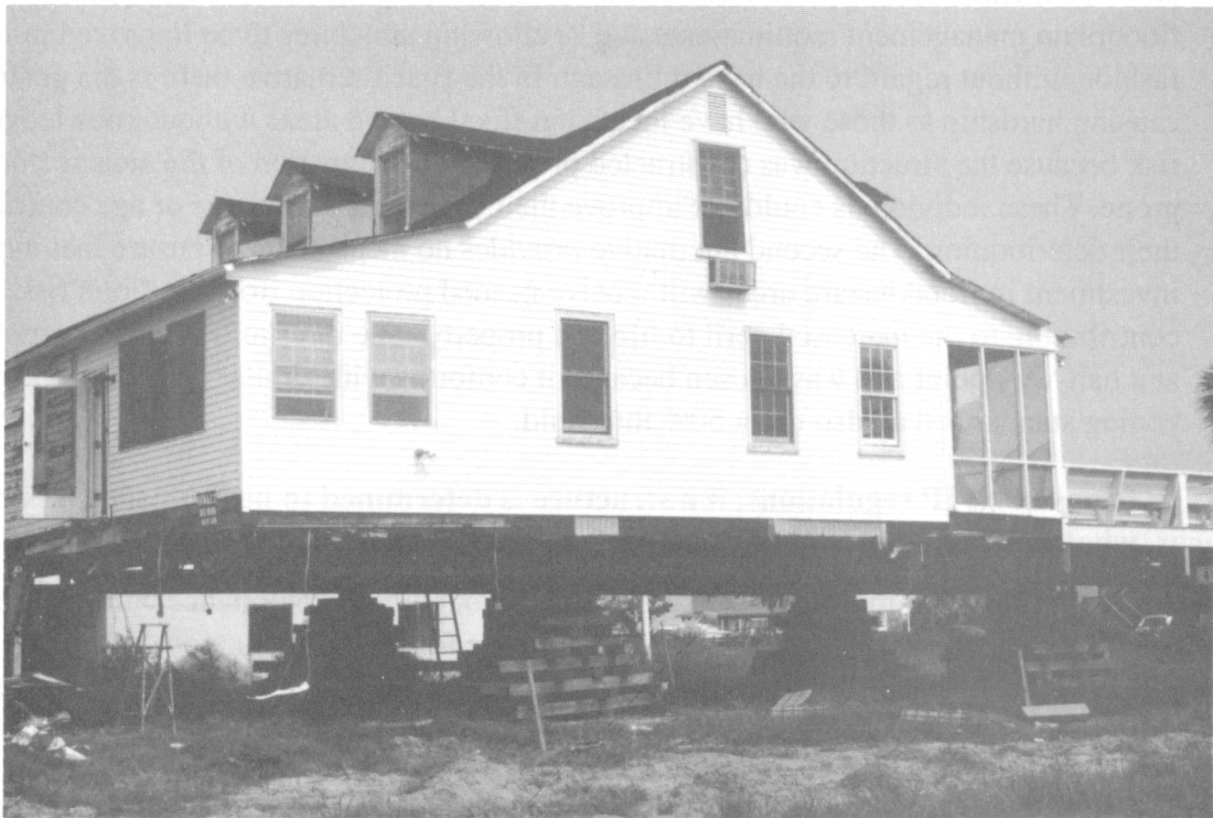
Figure 1. Photograph of a Pre-FIRM structure located on Sullivan's Island, South Carolina which was substantially damaged during Hurricane Hugo. NOTE: The structure has been repaired and is in the process of being elevated to or above the base flood elevation in accordance with NFIP requirements for substantial improvement (Refer to Question No. 9).

FEMA has established a procedure for the flood insurance policies directly written by the NFIP called Post Flood Underwriting. Under this procedure, if a building claim is 50 percent or more of the building's value, the claim is referred to the NFIP's underwriters. At renewal time, the policyholder must submit a new flood insurance application with a elevation certificate. The building is then rated as a Post-FIRM building. The Write Your Own (WYO) Companies that participate in the NFIP are required to have similar underwriting procedures.